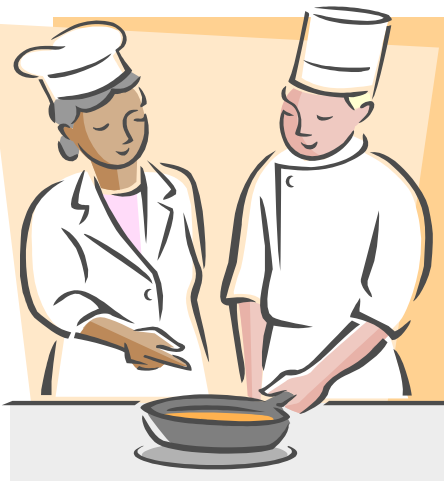
EXCELLENCE THROUGH TEAMWORK!

Auntie Anne's, BK Club, Buffalo Wild Wings, Chipotle Mexican Grill, CVS Pharmacy (LWE & Main St.), Dollar Tree (Town & Country), Family Dollar (N. Bittersweet), Five Guys Burger & Fries, Hana Yori of Japan, KFC/A&W, Meijer #128 (Fuel Center & Starbucks), Michiana Putt-Putt, Morgan's & Little Black Dog Tavern, Oak-